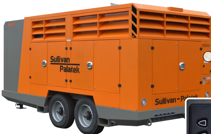
Sullivan-Palatek Electronic Controller (SPEC)