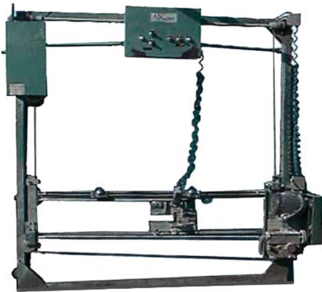
ABC Automatic 7'-6" x 7'-6"