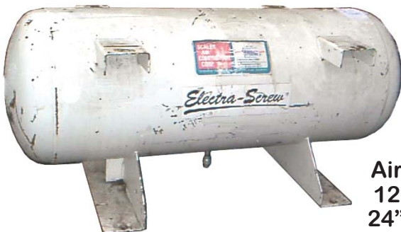
Air Tank 120 gal. 24" x 67"