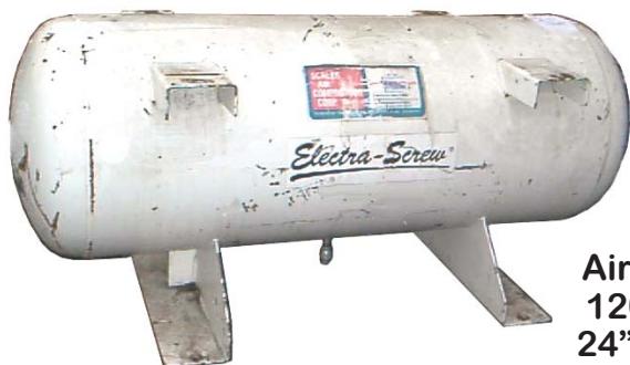
Air Tank 120 gal. 24" x 67"