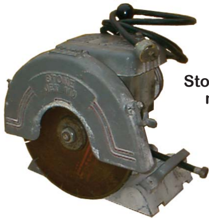
Stone diamond saw model Jet 110 14" blade 110 volt with tracks