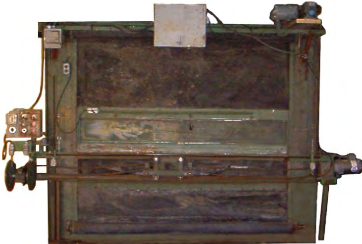
Dye Machine Co. 9'-0" Automatic Automatic with curtain 208-220/440v, 3 ph