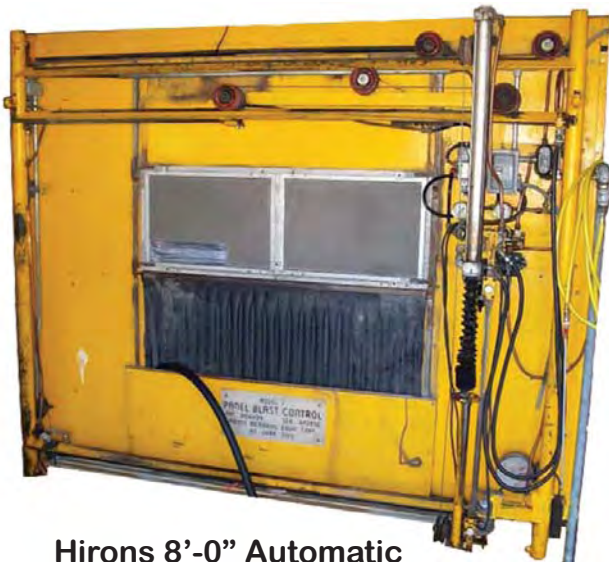
Hirsons 8'-0" Automatic