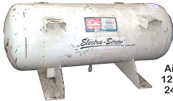
Air Tank 120 gallon 24" x 67"