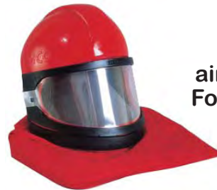
Clemco Apollo 60 air supplied hood (new) For use with airline filter