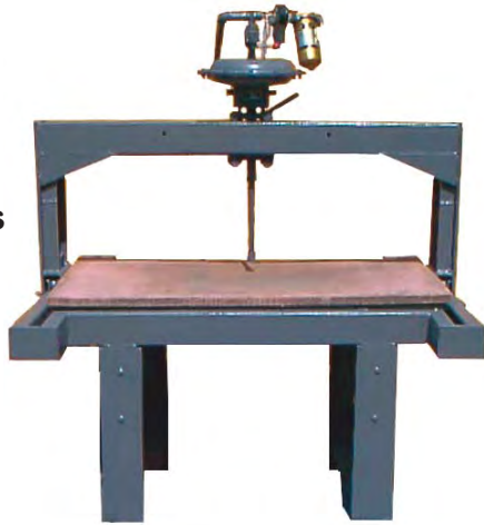
Pall bridge press air operated size: 46" x 30"