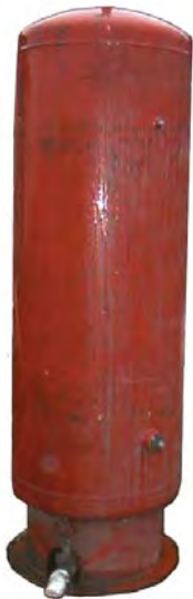
Air Tank approx. 240 gal. size: 30" x 97"