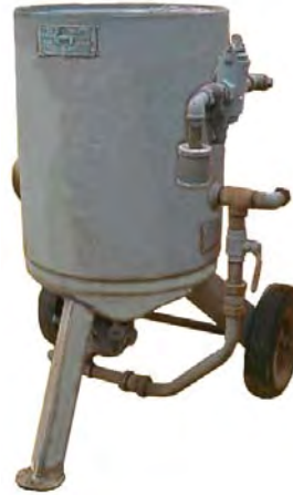
600lb Clemco with pneumatic remote controls