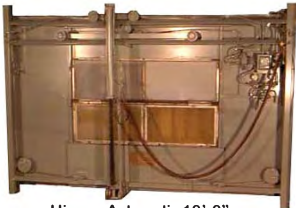
Hirons Automatic 10'-0"