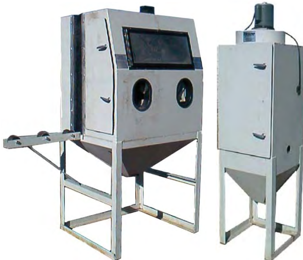
Blast cabinet - Cyclone model SL3730 Pass Thru, 30" deep. Two side openings (36" wide) with 400 cfm dust collector