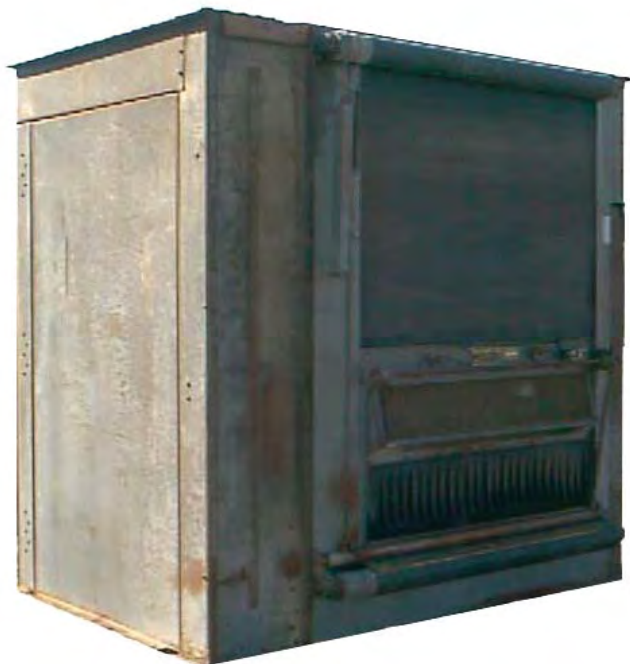
Blast room - Ruemelin 7'-6" X 5'-0", with 5'-8" blast curtain with inspection window