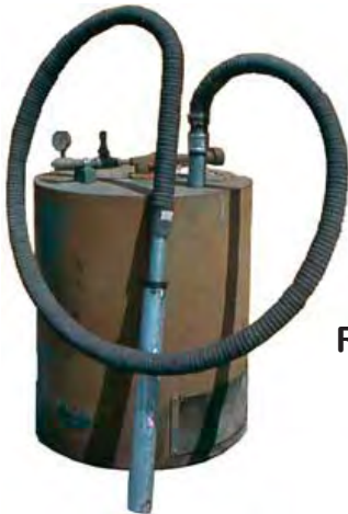
Ruemelin 5600 pneumatic abrasive pickup