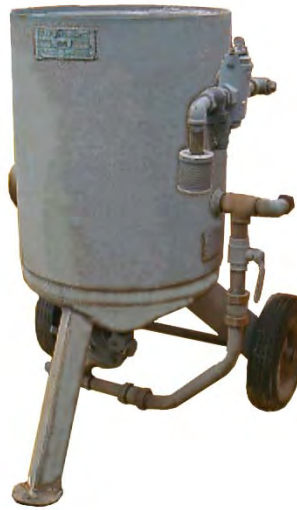
600lb Clemco with pneumatic remote controls