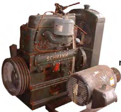
25 HP Schramm model 105 approx. 100 cfm 3 phase with motor starter, radiator and belts