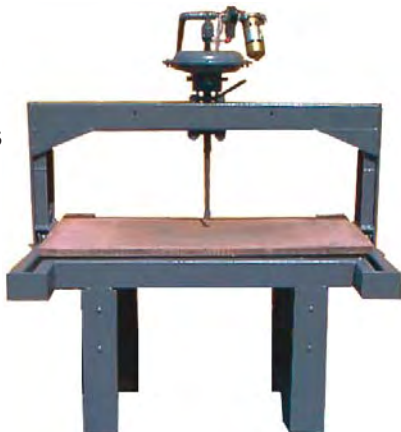
Pall bridge press air operated 46" x 30" with electric air compressor to run press