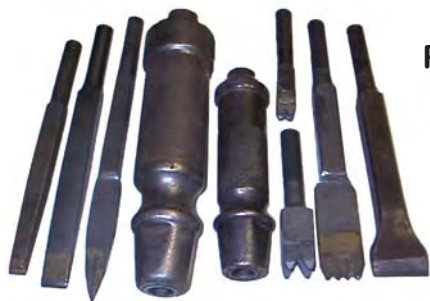
Pneumatic carving tools and carbide tipped chisels Many sizes and styles available.