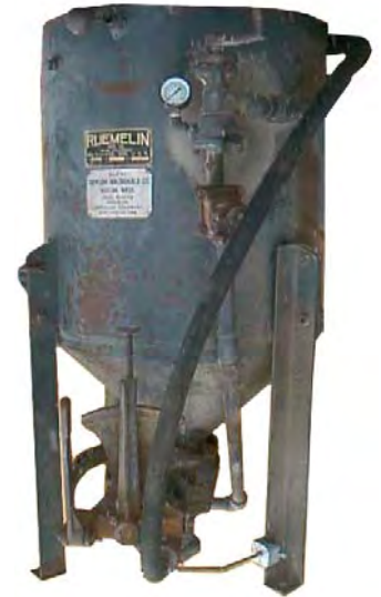
750lb. Ruemelin with all new piping & new plunger style mixer box