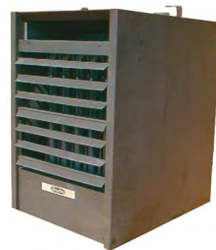
Daton space heater model 3E229 125,000 BTU gas/propane