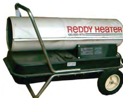
Reddy heater 100,000 BTU