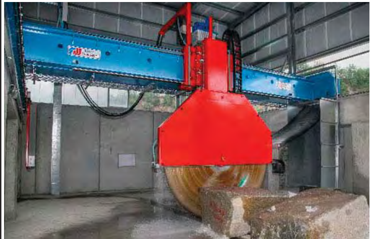
Frickert Winterling gantry diamond saw, 11'-6" blade, 480 volt, 3 ph, saw moves on 40' long rails.